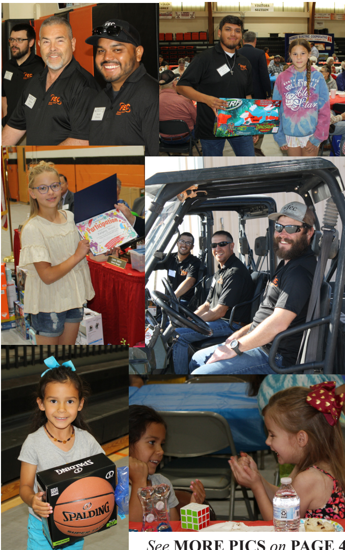
See MORE PICS on PAGE 4